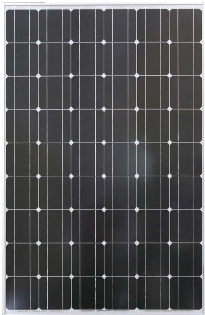
The photo is showing PCAxxx-A01